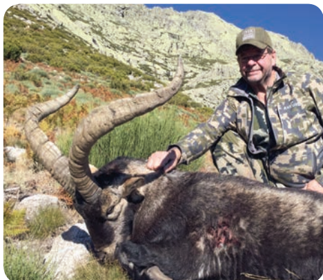
This Gredos ibex from Spain was taken in November 2017 by Rusty Blyler (PA). Rusty was huntin with Iber Hunting.