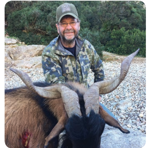
This Mallorcan wild goat was taken from the Island of Mallorca by Rusty Blyler (PA) in November 2017.