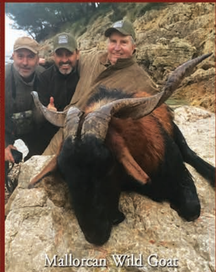
Mallorcan Wild Goat